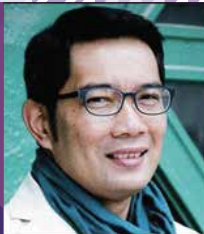
Ar. RIDWAN KAMIL (TBC)

Hence cities have to reinvent themselves and rethink policies that leads to solutions towards millennial challenges. This conference is an opportunity to learn of city transformation that is pertinent to address current and future challenges. By looking at various successful experiences locally and internationally, Malaysian urban managers, policy makers, professionals and the community can leapfrog into the appropriate, effective and appropriate actions, learning from the past and expediting solutions for the future.